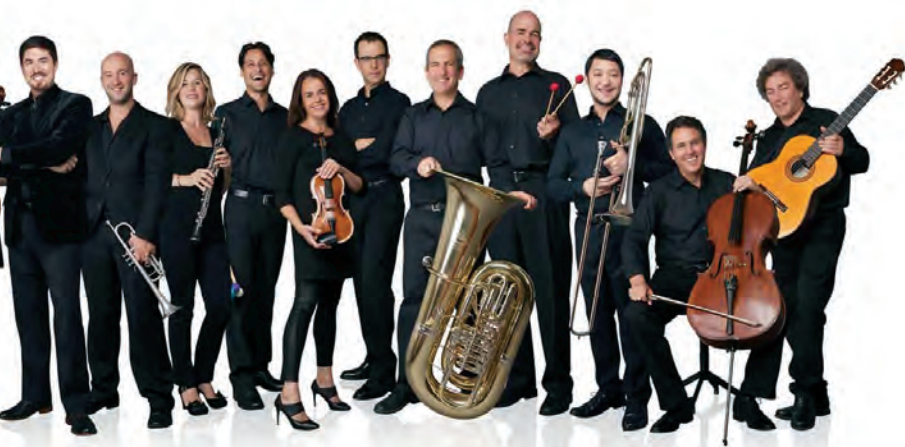
SAN FRANCISCO CONTEMPORARY MUSIC PLAYERS